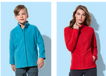
ST5170 Fleece Jacket Kids ST5100 Fleece Jacket