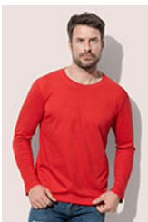
ST2500 Classic-T Long Sleeve