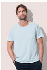
ST9450 Shawn Oversized Slub