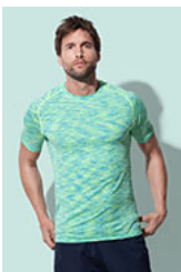
ST8800 Seamless Raglan